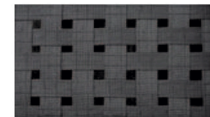
Bed made of reinforced belt fabric